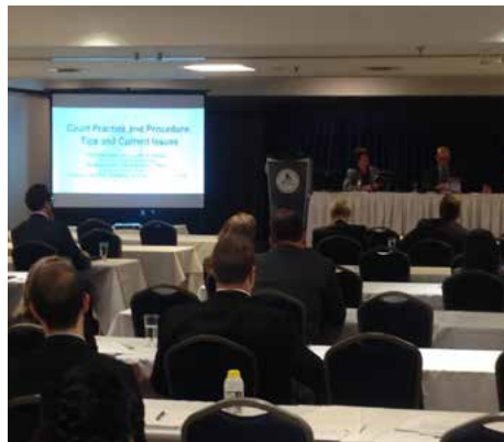
Halifax Senior Counsel Forum, May 2015