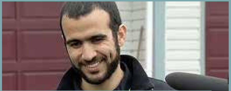
Omar Khadr was recently released on bail by an Alberta court after spending more than a decade in Guantanamo Bay