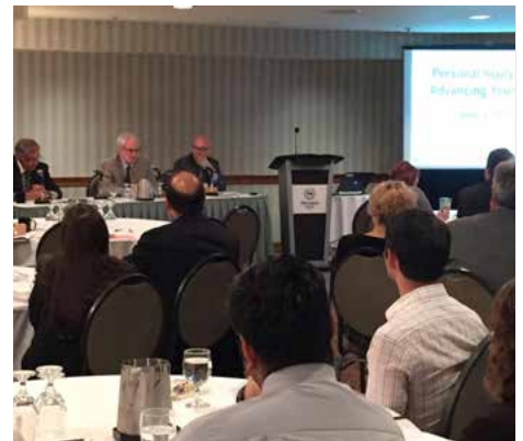
Ottawa Personal Injury Conference, June 2015

Don't Miss The neesons Photo Booth At The End of Term After-Party