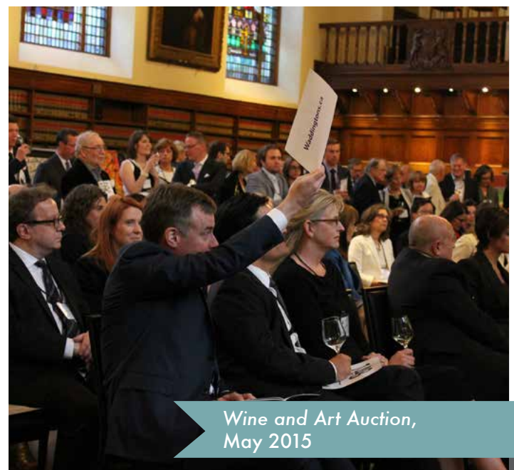
Wine and Art Auction, May 2015