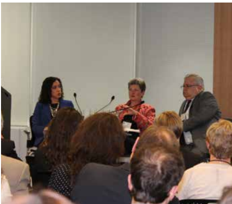
Current Issues in Administrative Law, June 2015