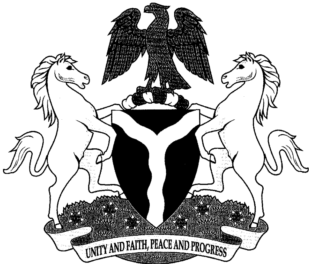
Nigerian coat of arms. (Vector-Images.com)

The aspiration toward national integration was also evident in some of the national symbols that were adopted at independence. The national anthem, composed by a British expatriate, acknowledged ethnic differences but stressed national unity: "Nigeria, we hail thee/ Our own dear native land/ Though tribe and tongue may differ/ In brotherhood we stand." Similarly, the new national motto and coat of arms evoked unity by incorporating symbols that connected the land and people of Nigeria. The coat of arms consisted of wavy bands of silver on a black shield representing the Niger and Benue rivers, two major rivers that run across the country. It also included the Cactus spectabilis , a wild flower common throughout the country. The adopted national motto was "Unity and Faith, Peace and Progress."